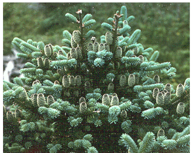
Variations in the foliage and cones of the bracted fir along coastal Newfoundland.